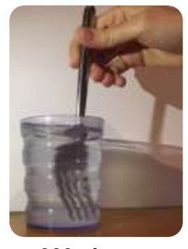
200mls Mix with a fork for 30 seconds. Allow to stand for one minute before drinking.