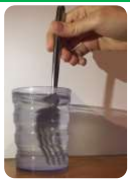
200mls Mix with a fork for 30 seconds. Allow to stand for one minute before drinking.